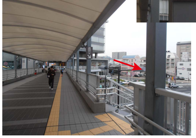
4. Take care not to mistake the bus. Many buses are stopping along the street.